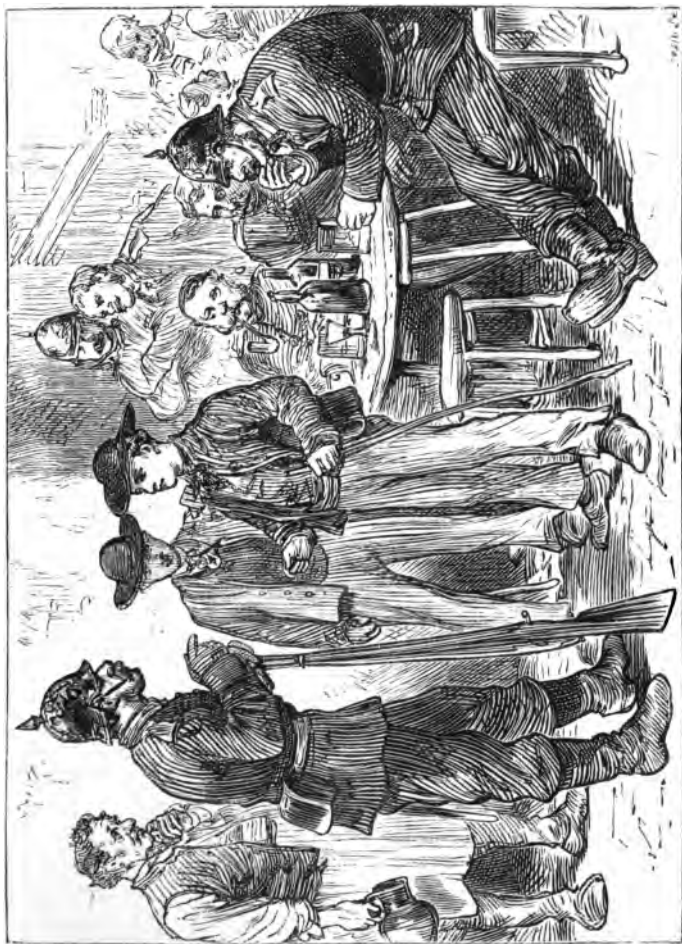
Among the German Soldiers. — Page 94